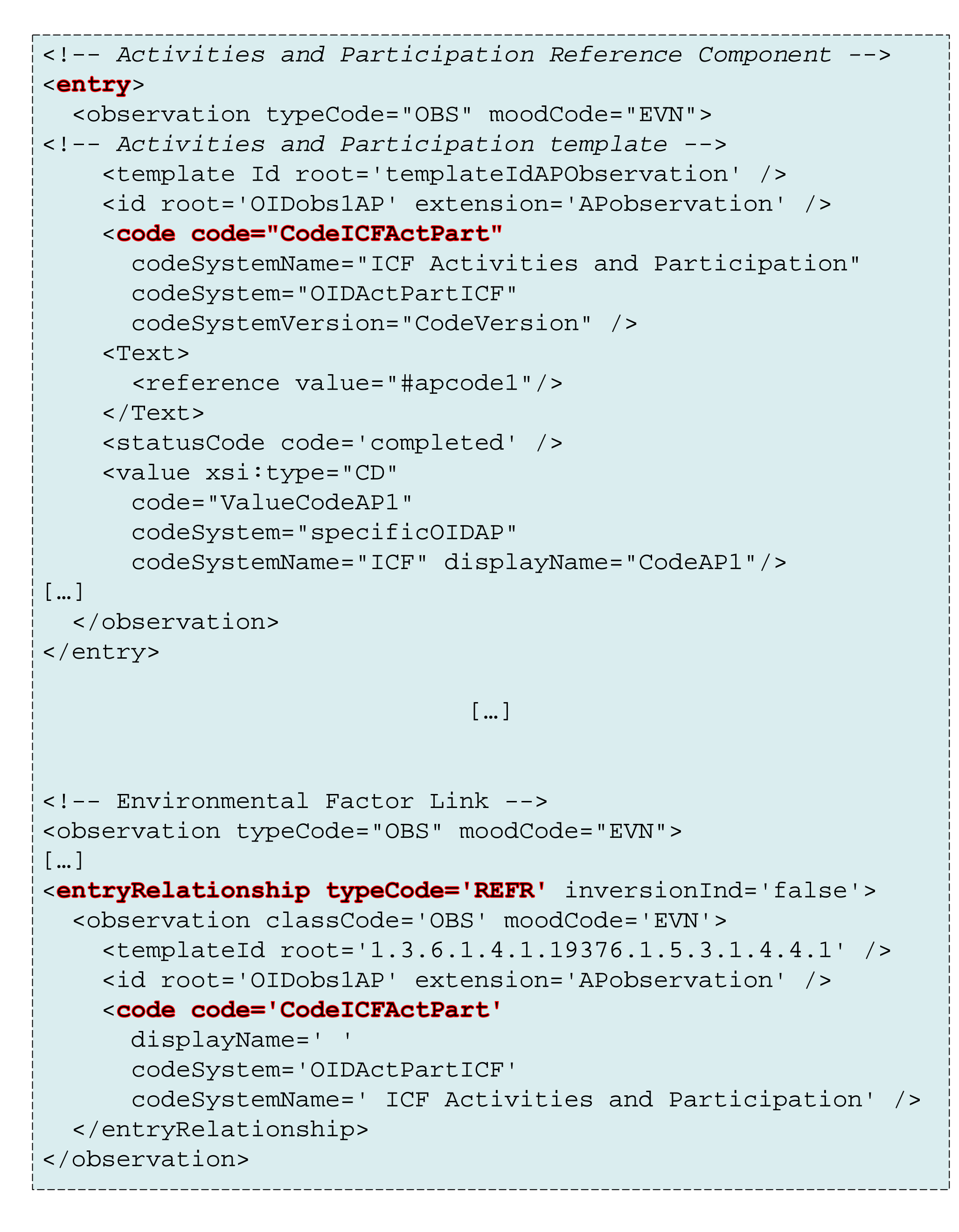
Figure 2 – Environmental Factors linked to single categories

Once the HL7-CDA2 template was developed, we analysed the elements in common with the PS, in order to provide a possible implementation into the PS. Two possibilities will be submitted to the Italian Authority that approves e-health standards (TSE).